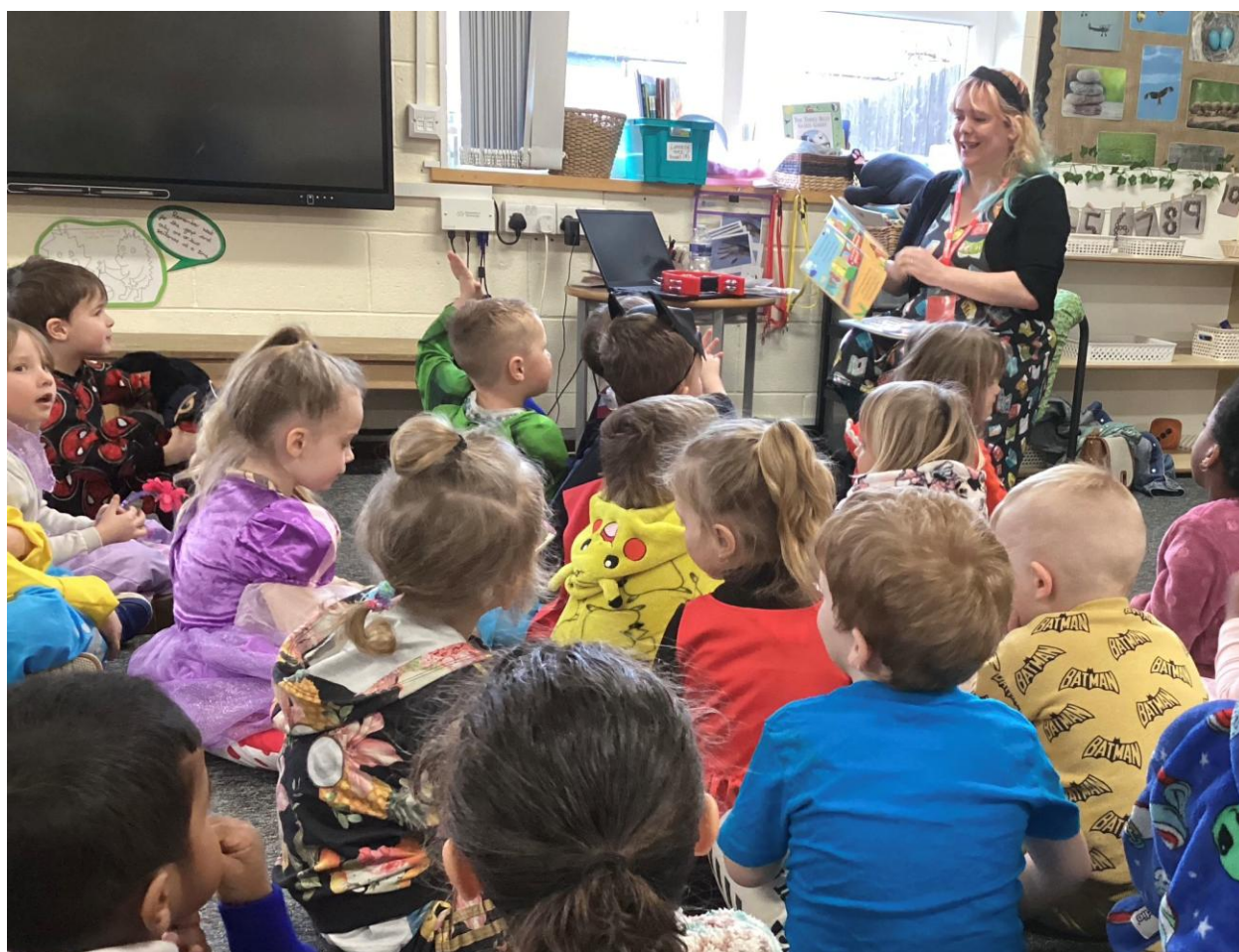
Reading train themed books on World Book Day.

Outcome: The World Book Day initiative successfully promoted community engagement and social inclusion by providing over 100 children with books, fostering a love of reading while raising awareness of rail safety. By combining education with safety through books, the initiative also helps to build rail confidence in families.