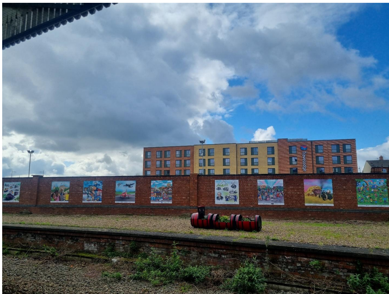
Romans to Railways artwork at Lincoln Station.

Outcome: This project successfully enhanced Lincoln Station's platform wall through artworks that celebrate the history of the area. The project aligns with the community engagement and social inclusion pillars of community rail, fostering a sense of local pride and connection. By involving local organisations and businesses, the project created a platform for collaboration and showcased the region's heritage. This project also promotes sustainability by creating a lasting, meaningful improvement to the station, which will benefit commuters and visitors for years to come.