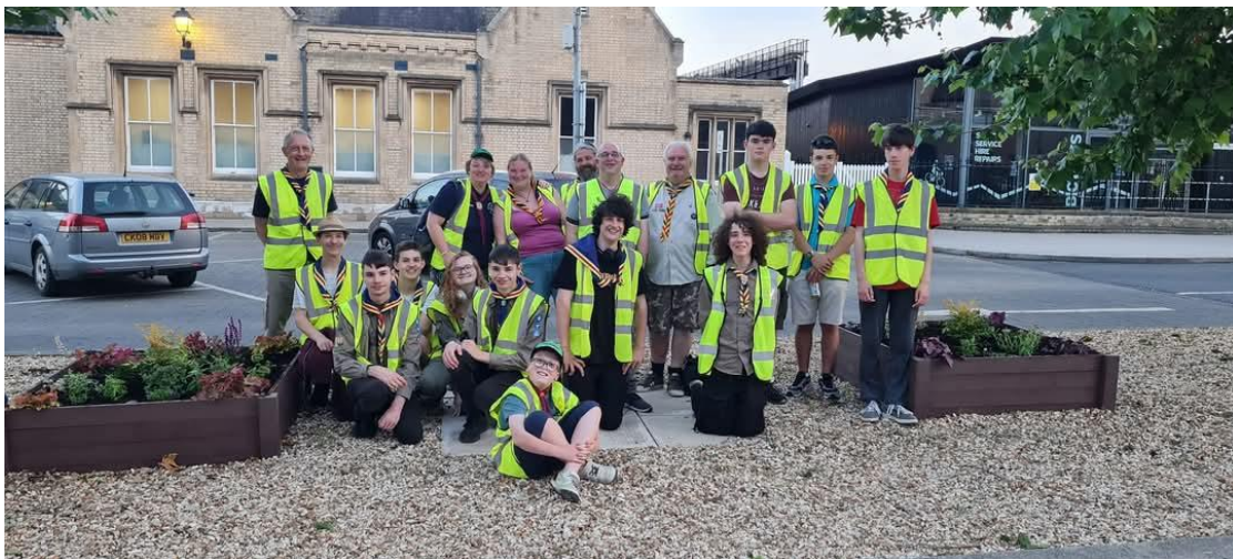
Lincoln Scouts with their new garden at Lincoln Station

Outcome: The Platforms for Change initiative, supported by NNLCRP, successfully engaged the Explorers in creating a station garden at Lincoln Central Station. This project aligns with the community engagement, volunteering, and sustainability pillars of community rail. By providing a flexible framework for Scout groups to collaborate with CRPs, the initiative fosters local involvement and promotes the benefits of rail activities to the wider community. Contact has been made with other groups throughout the network and NNLCRP plans to deliver more sessions throughout the year.