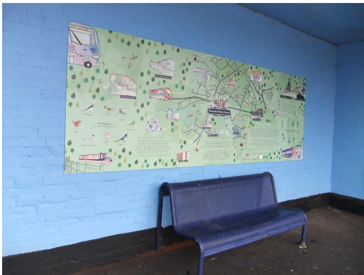
Shireoaks Station mural.

Outcome: This project aligns with the community engagement, social inclusion, and volunteering pillars of community rail. By collaborating with Artworks, the project promotes inclusivity and offers a platform for local talent. The collective efforts of NNLCRP, Shireoaks Station Adopters, and Northern in painting the shelter reflect the power of community collaboration. The mural installation, expected in early 2025, will enhance the station's environment, strengthening the connection between the community and the rail network while promoting sustainability through creative, lasting improvements.