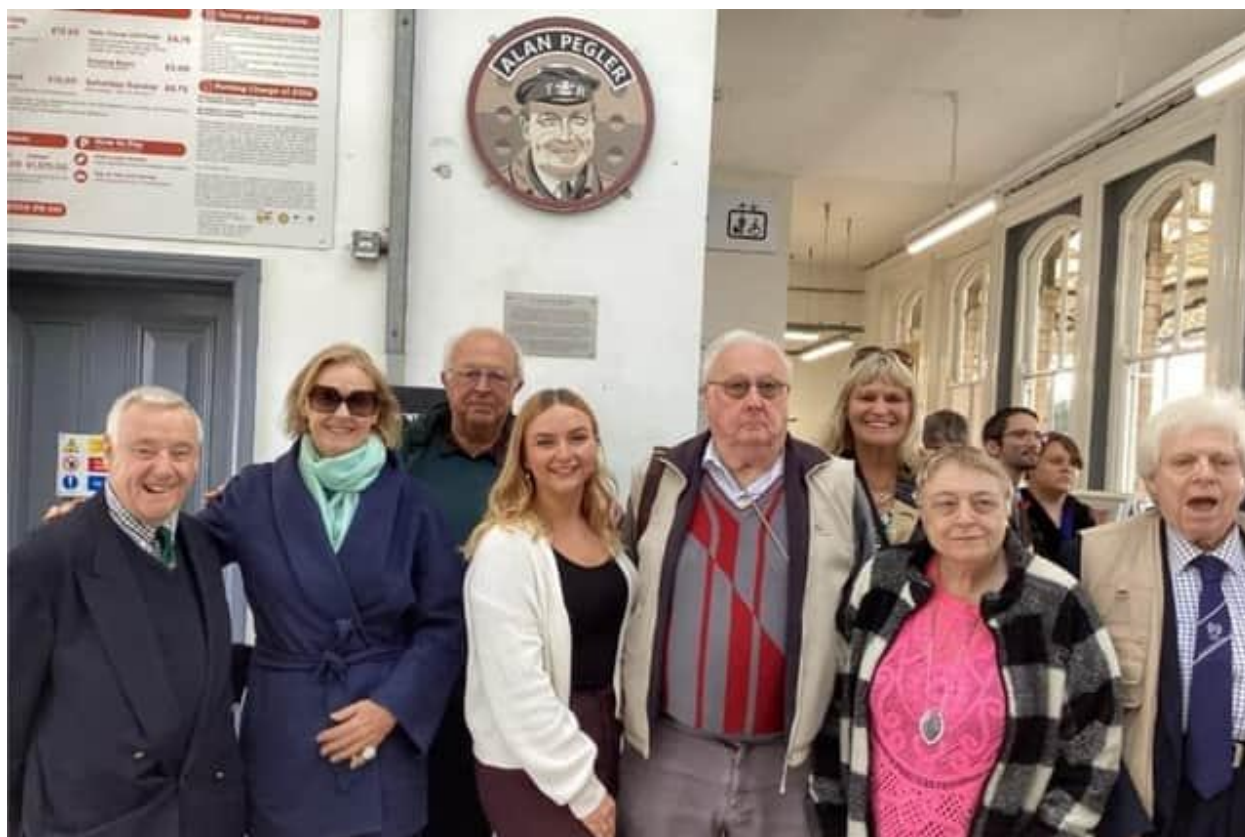
Family members and local society members on Retford Heritage Day posing with the Alan Pegler mosaic in the ticket hall at Retford Station.

Outcome: The unveiling of the Alan Pegler mosaic, along with the installation of The Flying Scotsman and Sir Nigel Gresley mosaics, successfully engaged the local community and enhanced the cultural significance of Retford Station. This project aligns with the community engagement and social inclusion pillars of community rail, celebrating local heritage and railway history. The event, held during Retford Heritage Day, fostered a sense of pride and connection among residents and visitors. Covered by the Worksop Guardian, it also raised awareness of the station’s community-driven initiatives.